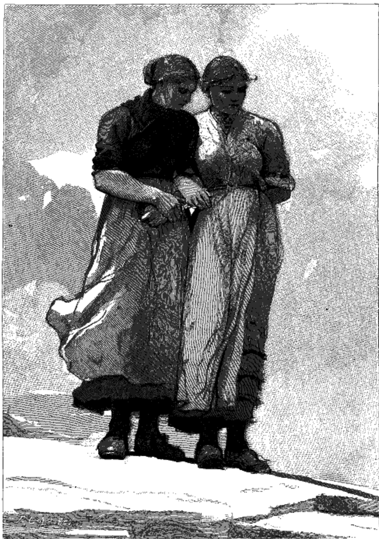
"LOOKING OVER THE CLIFF."