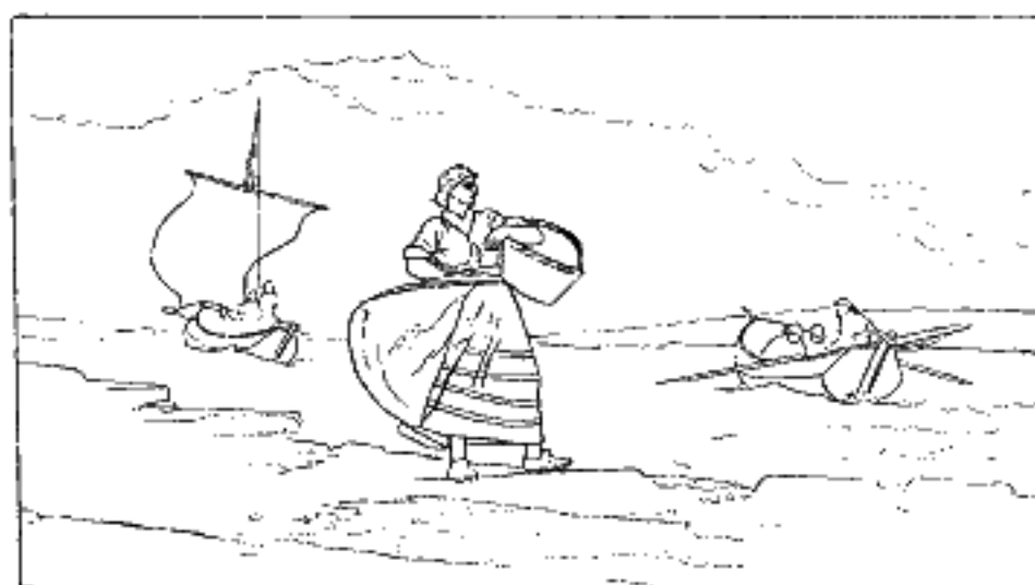
OUTLINE OF "INSIDE THE BAR."

technique will not make up for conventionality of feeling, for lack of sentiment and personality on the artist's part. The way he feels and the way he speaks—these are the two parallel things which must always