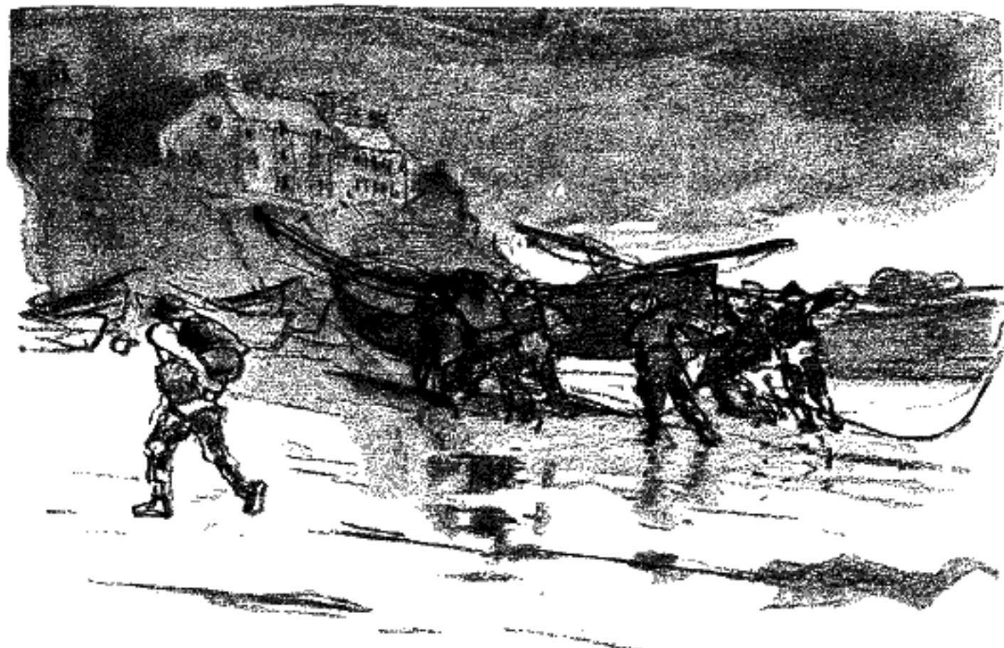
A CHARCOAL SKETCH, BY WINSLOW HOMER.

Mr. Homer was born in Boston in 1836. At the age of six his family removed to Cambridge, where country life fostered