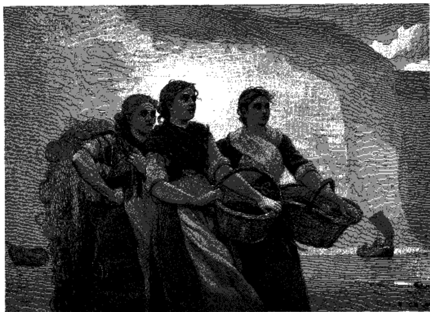
LISTENING TO THE VOICE FROM THE CLIFFS.

to a relief in marble; and yet there is none of the stiffness, the immobility, with which plastically symmetrical effects are usually attended in painted work. They are statuesque figures, but they are living, moving, breathing beings, and not statues; and they are as characteristic, as simply natural and unconventional, as are the most awkward of Mr. Homer's Yankee children. It is interesting to note how this fine symmetry has been secured—as it is often secured in art of very different kinds, though more frequently in marble than in paint. The method is one that needs a master hand to manage it aright. It works first, of course, by making the lines fine in themselves, and then by making the lines of one figure reproduce to a great degree the lines of its fellows—not nearly enough to produce monotony and stiffness, but nearly enough to secure repose, harmony, and a sort of rhythmical unity not to be obtained in other ways. This device—the word is correct, for what looks to us like artistic instinct is always, of course, artistic reasoning, conscious or unconscious—is used throughout these English pictures and studies of Mr. Homer's, and often with the most exquisite result. In a water-color not yet exhibited,—which is a most remarkable rendering of figures seen through a thick fog,—there is in particular a group of two girls with their arms